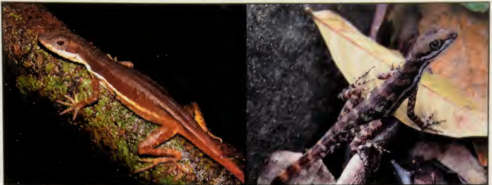
Figure 1. Anolis oxylophus at La Selva Biological Station (left, photo by Christian Perez) and Anolis aquaticus at Las Cruces Biological Station (right, posed).

al. (2015) found that these species differ in two morphological traits not measured by Leal et al. (2002): claw shape, which affects clinging ability on rocks (Zani, 2000), and the ratio of fore- to hindlimb length, which is relatively large in many specialized climbers (Cartmill, 1985; Vanhooydonck and Van Damme, 2001). With its shorter claws, relatively longer forelimbs, and relatively shorter hindlimbs, A. aquaticus appears to be specialized for climbing on rocks, particularly when compared to A. oxylophus . This microhabitat specialization may be due to substrate availability, substrate selectivity by lizards, or both.